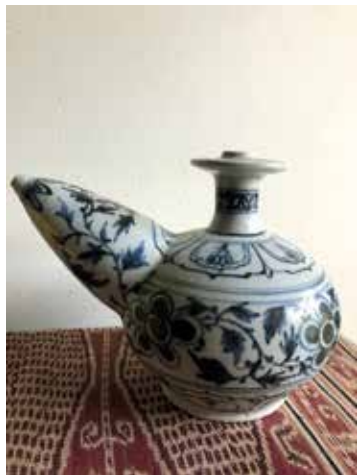
Blue and white Vietnamese kendi with large mammillary format, 16 th century

The bottle is filled from the neck, held by the neck and water drunk from the spout. The advantage of the utilitarian kendi was that it could be carried from place to place when water was not freely available and shared without the risk of contamination as lips do not touch the vessel.