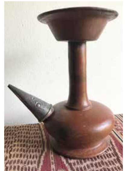
Terracotta kendi with added silver spout. Java probably Majapahit

Currently, archaeologists continue to discover new sites, both on land and in maritime zones, while also reinvestigating ancient Southeast Asian sites in an attempt to further unravel the origins of the kendi to provide a more rounded picture of its history.