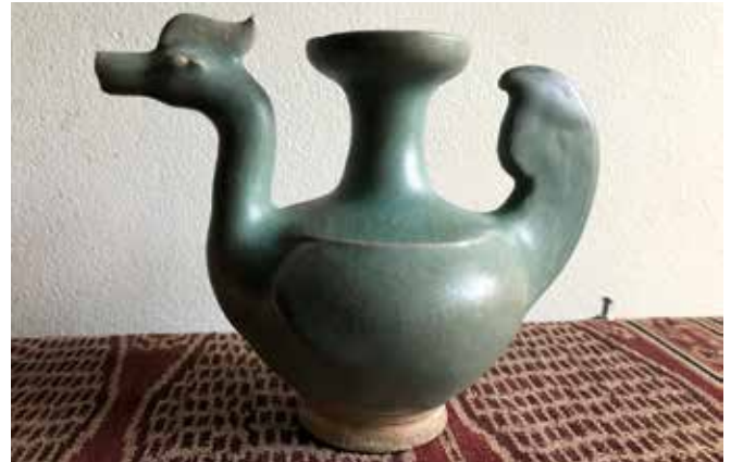
Celadon kendi the form of a Hamsa, the mythical Thai bird. Sawankhalok, around the 16 th century

Many materials were used to produce kendis , including earthenware, stoneware, porcelain, brass, pewter, copper and silver alloy, gold and bronze. Even in vessels employing the same material, notable differentiation in size, shape and decoration can be observed. For example, spouts may be straight,