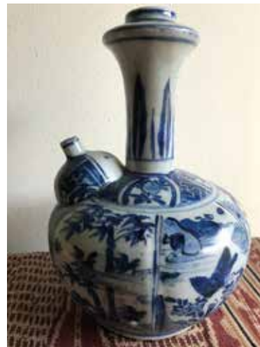
Chinese blue and white kendi for the export market, 18 th century

bulbous or flanged, long and thin or zoomorphic. The bulbous or mammiform-spouted kendi emblematic of fertility, was probably the most common shape produced in many countries, including Indonesia, Thailand and Vietnam. Kendis with thin, curved spouts appeared in China as early as the 14 th century, but by the 17 th had lengthened considerably to resemble the spouts on Middle Eastern ewers (Rinaldi:177).