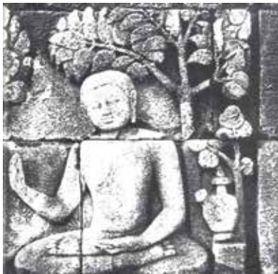
Buddha figure at Borobudur with a vessel that may represent a transitional type of ware between the kundika and the kendi