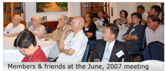
Members & friends at the June, 2007 meeting

One very specific & very important statement: the Philippines was THE gateway and formed the entrance into the Pacific for this migration that moved people through thousands of years. It was fascinating to hear about farming populations that moved through China, and then had to adapt to the tropics when they entered the Philippines. In China, diets were based on rice and millet, but the migrants learned to adapt to tuber and fruit-based diets as they settled in Micronesia. The Philippines, situated as it was, was at the heart of this transformation.