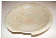
Unearthed and unrecorded item

He enlightened his audience on the notion of changes in ethics through time and generations, and pointed out that the two communities of collectors and archaeologists, once in divide with arrogance on both sides, are united within a broader context of the preservation of cultural heritage.