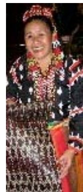
T'boli woman holding gavel

The T'boli people of Lake Sebu, one of more than 30 ethnic tribes living in the lush mountains and forests of Mindanao, are renowned for their unique culture and ethos expressed through their weaving, metal craft, poetry, music and dances. T'bolis' t'nalak weaving and elaborate, colorful attires celebrate the essence of tribal life and their spiritual relationship with nature.