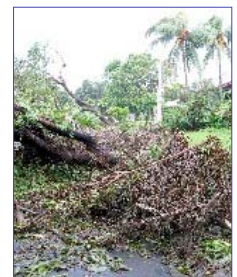
One of the scars left by typhoon Xangsane in Manila