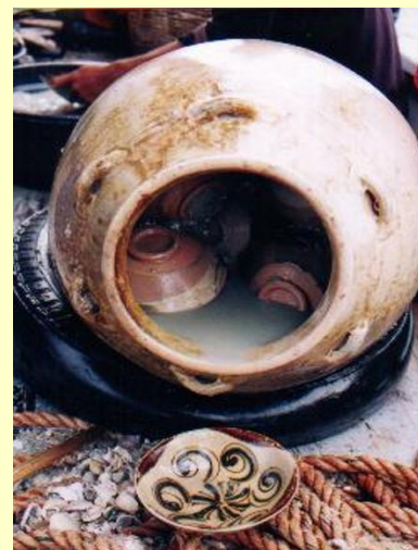
Dusun Jar found in Belitung Wreck