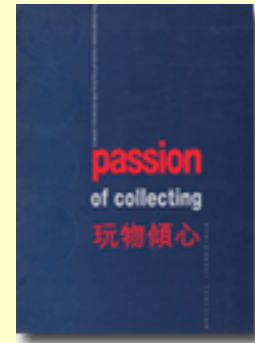
Passion of Collecting (1999-2000 Exhibition) HK$300 HK$150