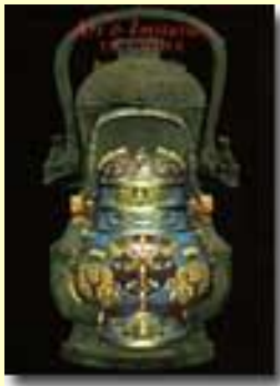
Art & Imitation in China (2006 Exhibition) HK$500 HK$350